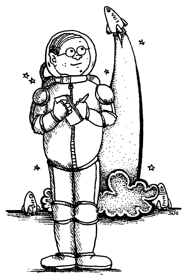
SAD BASTARDS OF the Future NO.5 THE ROCKET SPOTTER

Most important, I fathomed my own limitations, and how little my subconscious could be bossed around. It's useful to know who really does most of the heavy lifting.